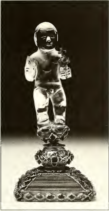
Figure 7. Christ the Saviour . India or Sri Lanka, ca. 1550–1650. Rock crystal, gold, rubies, and sapphires, 13.7 x 4.3 x 3.7. Peabody Essex Museum, Museum purchase with funds donated anonymously, AE85,219